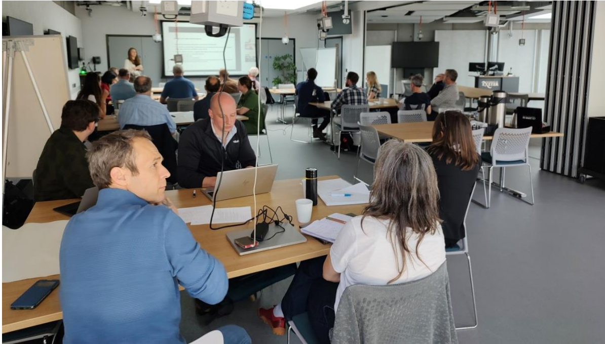
Figure 1 - Workshop at the University of Exeter on 29 April.